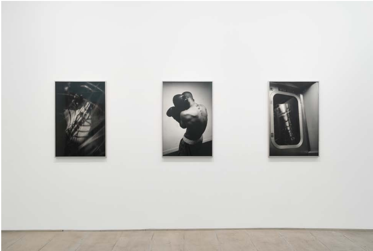
Installation View: Elle Pérez: guabancex , 47 Canal, New York, 2023.