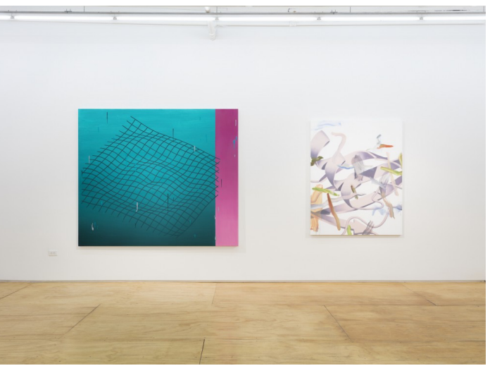
Bathers installation view