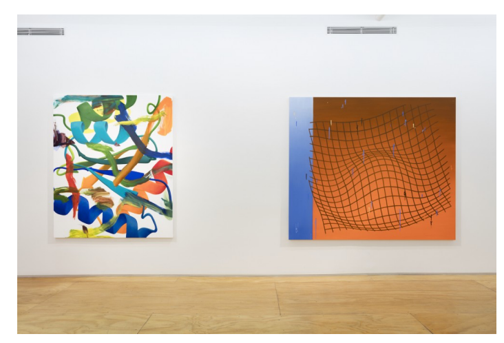
Bathers installation view

On Elephant's return to the city for 2016's The Armory Show, we spent a day discovering and rediscovering the now wellestablished array of galleries and exhibitions that are hidden in basements, on top floors above Chinese restaurants, and pretty much anywhere dismissed by the local hospitality industry. Here are some of our favourites: