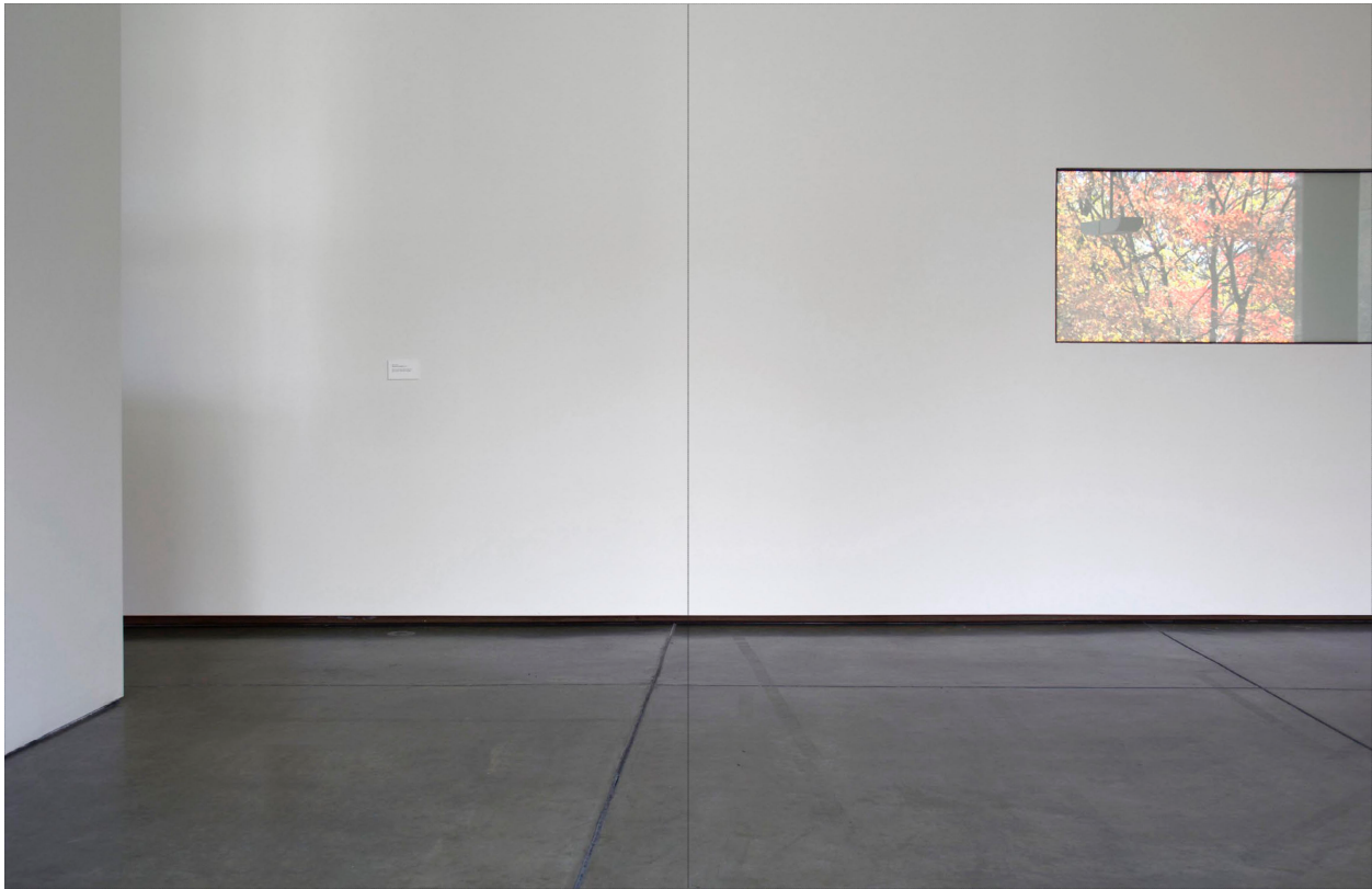
Removed and Applied, episode one , in a spread from An Organized System of Instructions , 46–47.

For the second episode, Beck reproduced the Carpenter Center’s inaugural press release from 1963 and distributed it both through the center’s mailing list and as a takeaway from a dispenser on the altered wall in the first episode. For the third episode, Beck compiled photographs from Harvard’s archive and distributed them as a digital slide show via CCVA’s website. These two simple gestures at once signaled the depth of institutional memory Beck was prepared to dive into as well as his further entrenchment into the institutional structure as he co-opted its two most used communication channels.