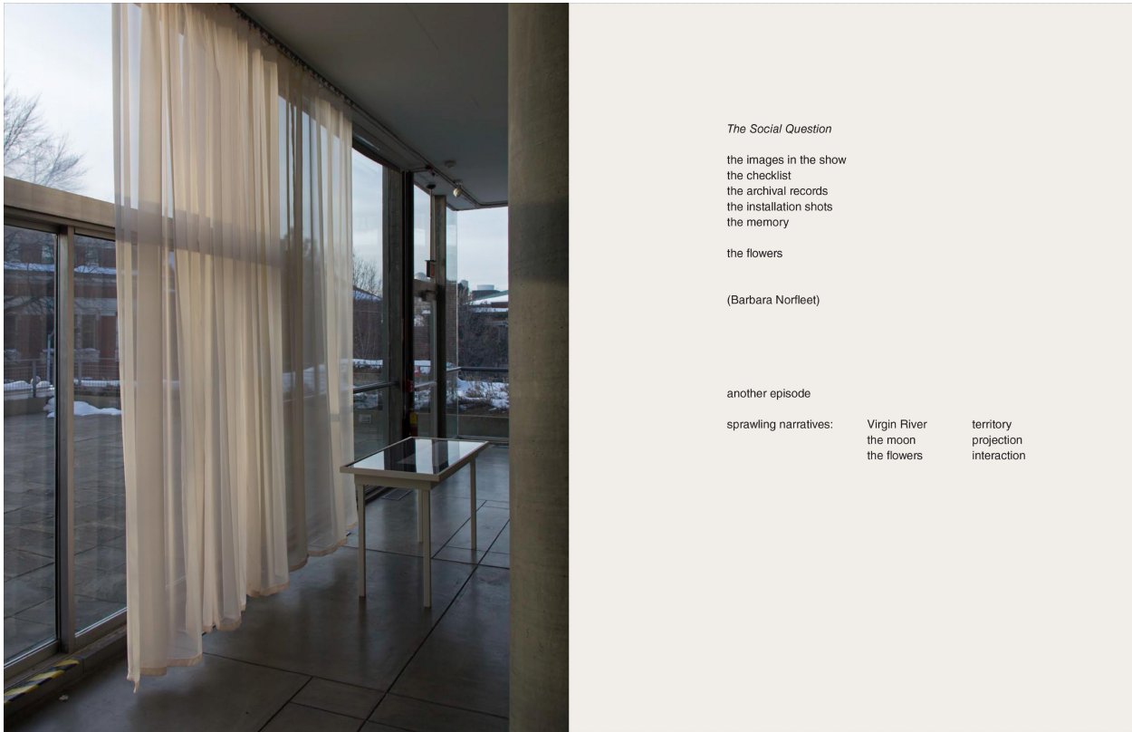
A Report of the Committee, episode four , in a spread from An Organized System of Instructions , 94–95.

Beck continued his dissection of the Carpenter Center’s institutional anatomy in episodes five and six. Episode five addressed the issue of visitor attendance, essential yet arguably the least artistic aspect of a museum. Beck took three attendance sheets, notebook pages with hash marks denoting the visitors, from the 1970s. These three sheets of paper, which resembled abstract drawings, testify to the beginning of the data-driven management of museums. The document was displayed on the left half of a large, white-laminated display system. Measuring 120 by 60 inches with the height of the display surface at 32 inches, this object was in the words of the artist, “neither a table for seated visitors nor a typical viewing surface for standing viewers, something in-between.” 11 The right half of this large structure was mysteriously left empty. Installed in July 2015, this episode took place during the summer break of Harvard (attendance sheets exhibited during the least attended time of the year). Upon the return of the students in September 2015, Beck completed this episode by placing a poster announcing the next episode on the right side that was hitherto left empty.