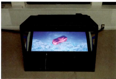
8. Below: Antoine Catala, Icy , 2012 , TV, glass, plastic car, LEDs, aluminum, wood, 32 x 32 x 44".

Catala's self-consciously lo-fi, analog takes on the high-tech digital-media landscape have been a highlight of many New York group shows over the past few years. Appropriating a Rube Goldberg-esque sense of wonder in his approach to both materials and ideas, which conjoins classroom-science-project aesthetics with high-brow semiotics, Catala created work for the 47 Canal show that not only looked like no other recent art but also felt different. His humor and wordplay often mask a decidedly singular and serious practice that I imagine will only continue to bear ever-stranger fruit.