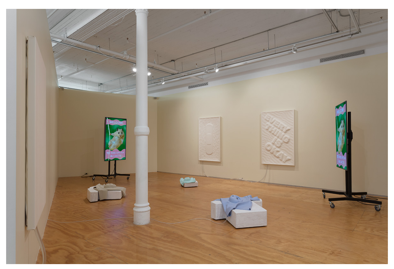
Everything is Okay installation view

gadgets – at the core he is a Conceptual Artist – but because with them he actually reveals or plays with how they are affecting us as humans. I don't know if he would mind me saying this, but I would like to think that he may be trying to reconnect us with our humanist ideals, lost somewhere in the 20th century. As he says, "the more I do art, the more I want it to have social implication."