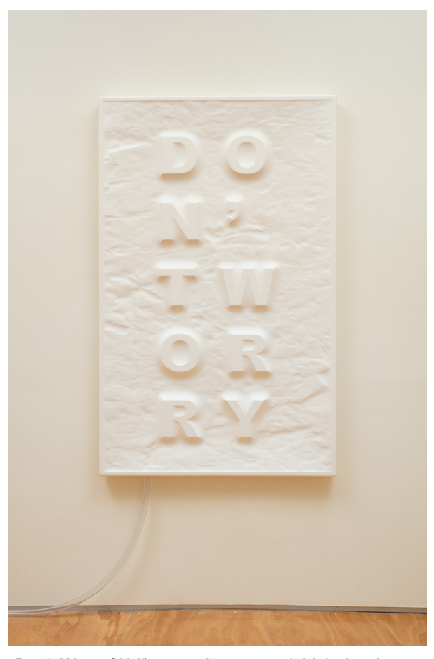
Don't Worry (Wall), 2017, latex, wood, high density foam, pump, edition of 3 +2AP, 58 \times 36 in., 147.3 \times 91.4 cm

AC: Yes, and the noise. If they were hidden inside the wall you would hear it anyway. It's like a vacuum... To find a silent one would be very hard or expensive. And I like the contrast between the message and the machines, and the reassurance and the machines. All my work ultimately is about an idea on how we implement technologies to sort of reflect the way we are. Technologies are like an extension of self or psyche. Not to show it is just to make a magical object, and I think it's nicer to make it mechanical/technological. And I really like pumps. I see it as assisted breathing, or assisted mechanism, so it feels there is a danger all the time. Like iron lungs or something like this. It's like you are helping something exist, basically. You keep it alive in a way, and there's a fragility to it. And I think that's important. I guess that everything moving has that fragility, but to expose that.