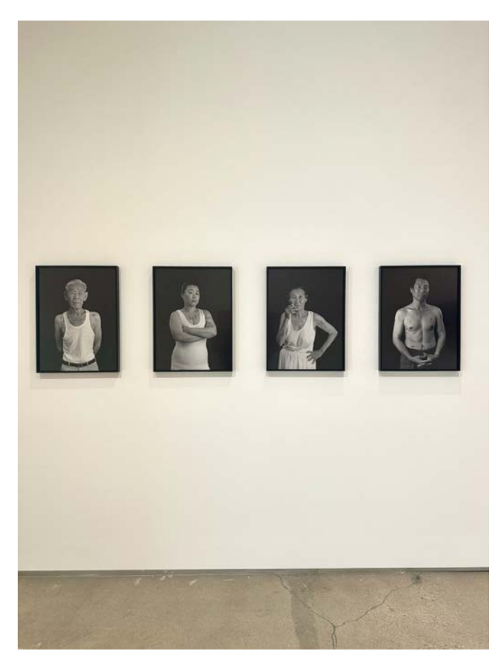
Installation view of works from Young Chung's Not By Birth series (1996/2023)