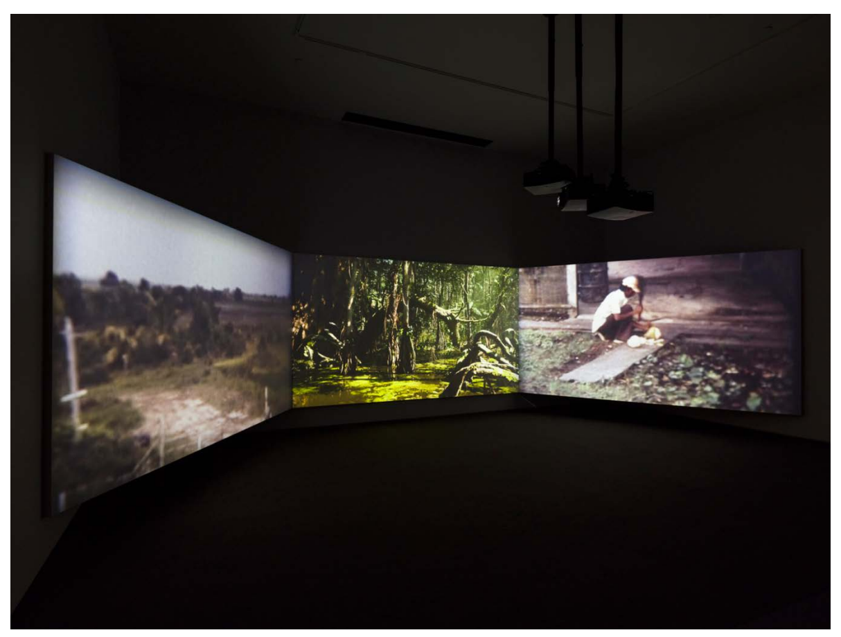
Installation view of Vishal Jugdeo and Miljohn Ruperto, "Cut Line" (2024), three-channel 4K video (color, single-channel audio, 26 min.)