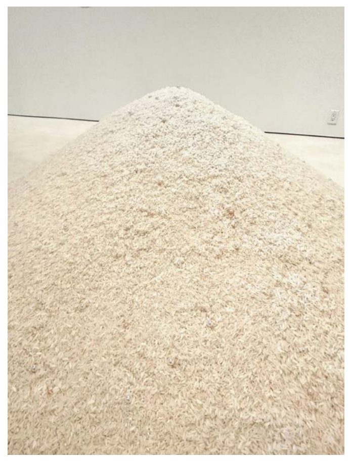
Installation view of Amy Yao, "Doppelgängers" (2016), rice, PVC rice, polyester resin, epoxy resin, freshwater pearls, and plastic pearls, 42 x 88 x 94 inches

In the same room, Amy Yao's work playfully engages with ideas of who can claim nativity, authenticity, or cultural legitimacy. Her AZN Clam series (2023) focuses on a species of clam originally from East Asia that has, through changes in water currents and human industry, spread throughout the world, becoming labeled "invasive" in North America. This work raises questions about what it means to be labeled foreign or invasive, who gets to decide such things, and the parallels between categorizing goods and categorizing people. "Doppelgängers" (2016) combines fake and real rice with fake and real pearls, referencing the often racist mistrust of Chinese goods, which, buttressed by stories of counterfeits and sweatshop labor, make the label "made in China" code for cheap or inauthentic. By combining relatively inexpensive goods like rice with more expensive goods like pearls, "Doppelgängers," raises questions about valuation.