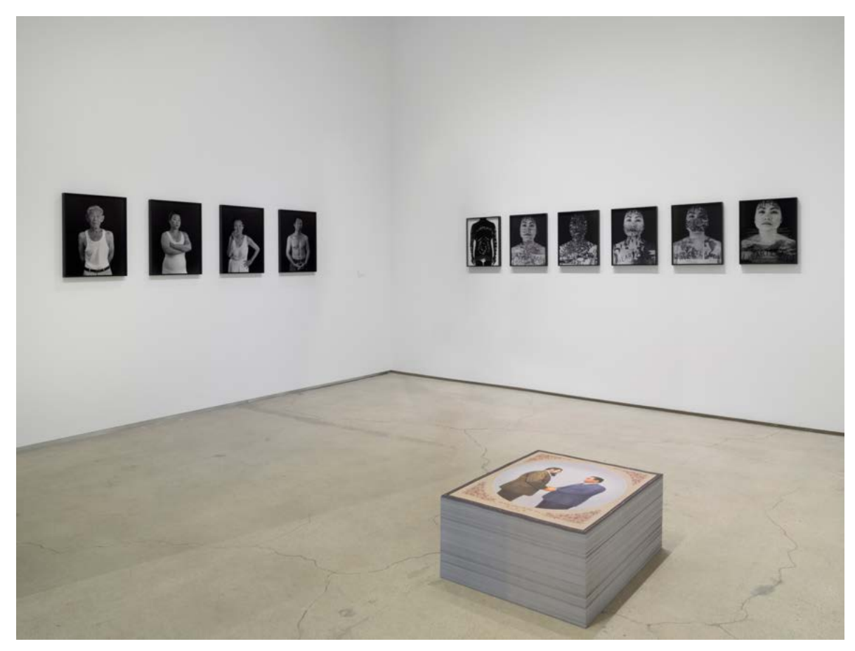
Installation view of Scratching at the Moon, featuring works by Yong Soon Min and Young Chung