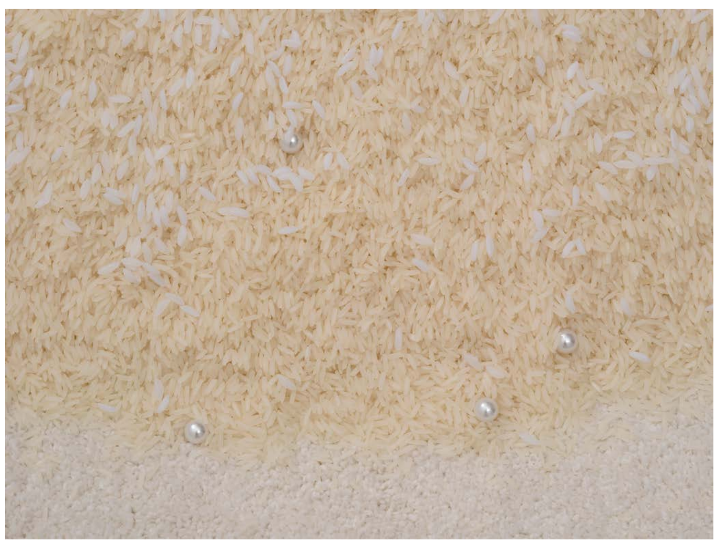
Detail of Amy Yao, "Doppelgängers" (2016), rice, PVC rice, polyester resin, epoxy resin, freshwater pearls, and plastic pearls, 42 x 88 x 94 inches

LOS ANGELES — Michelle Lopez's "Correctional Lighting" (2024) is one of two massive sculptures that greet the viewer as they enter Scratching at the Moon at the Institute of Contemporary Art, Los Angeles (ICA LA), an intergenerational exhibition of 13 Asian American artists with strong ties to Los Angeles. It consists of a suspended upside-down highway light secured with yellow rigging straps to a semitransparent cinder block, which acts as a counterweight. The connections between the elements feel strained, tenuous, and awkward. Although the sculpture itself is quite elegant, the harsh, surveillant glare and soft electrical buzz of the slowly spinning light casts its