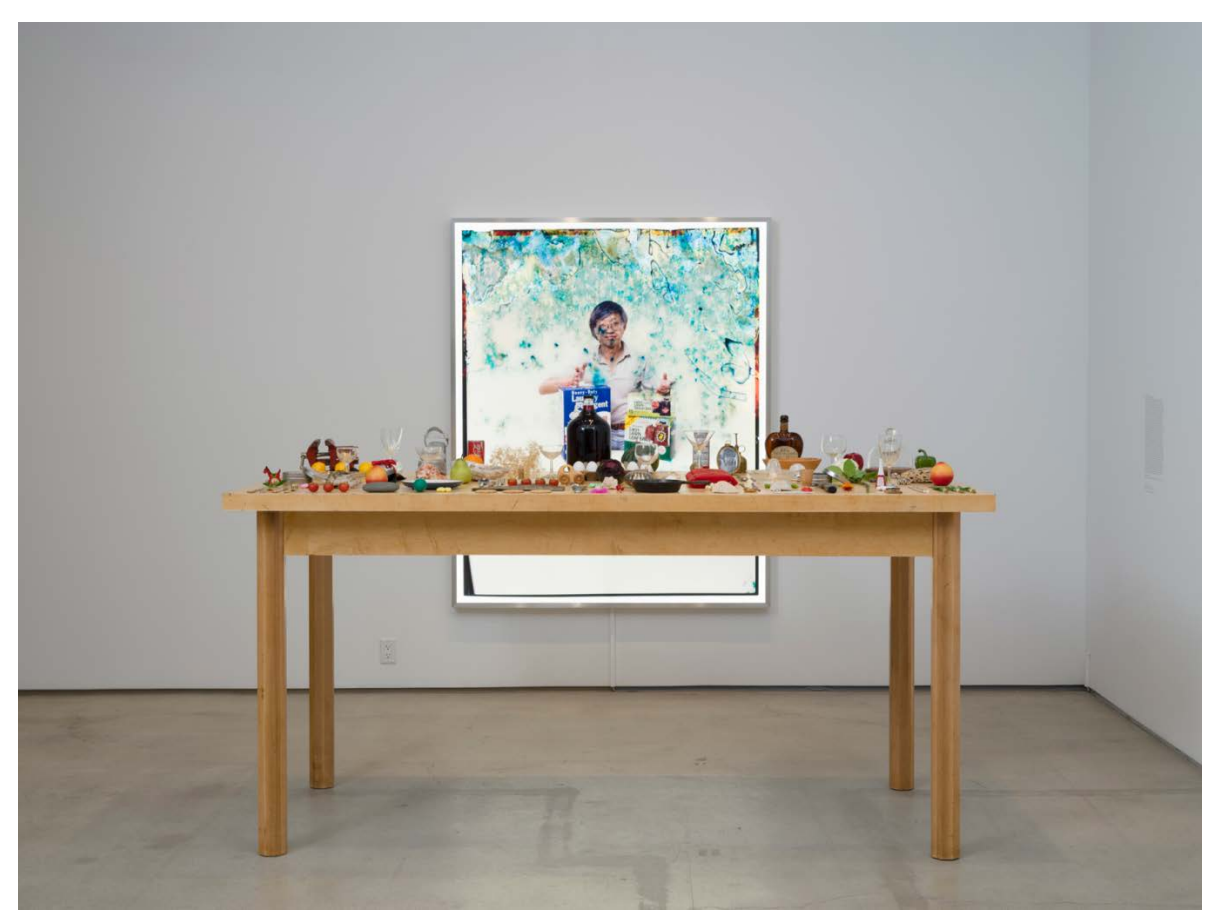
Installation view of Scratching at the Moon, featuring works by Amanda Ross-Ho