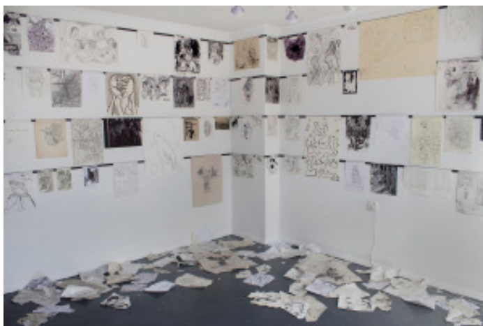
‘Draw Gym.’