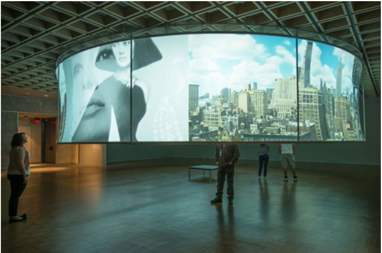
Installation view of T. J. Wilcox, 'In the Air,' 2013.

It's been brutal trying to whittle down a "best of" list for 2013, but the top slot? That's easy: the New York art world's recovery after Hurricane Sandy. It's astounding to think back to October 2012, when galleries were flooded and art was destroyed, when artists and art handlers, dealers and interns could be found without electricity, carrying soggy works from basements, tearing out drywalls and trying to figure out what to do next. The entire foundation of the art world felt threatened. But galleries dug out. They raised money to help dealers who had suffered losses, and by January most of the affected ones were up and running again.