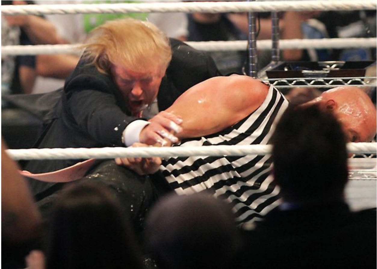
President-elect Donald Trump

voters said to be in the “flyover zone” of America has reached a boil. We, the liberal-minded frogs, did not notice the pot’s temperature rising and are now potentially cooked.